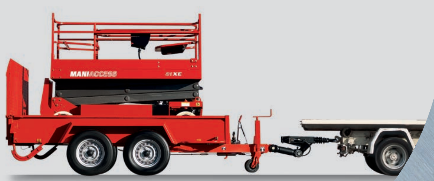
These very light machines can be transported easily on trailers with a maximum weight of 3.5 t.