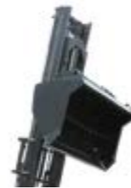
Tilting carriage (only on MC25 and MC30)