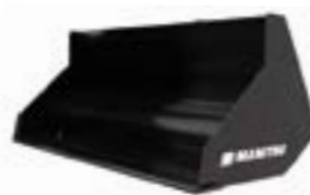
Bucket (only on MC25 and MC30)